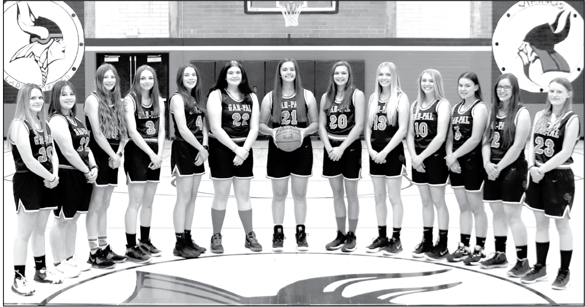
GARFIELD-PALOUSE SCHOOL DISTRICT