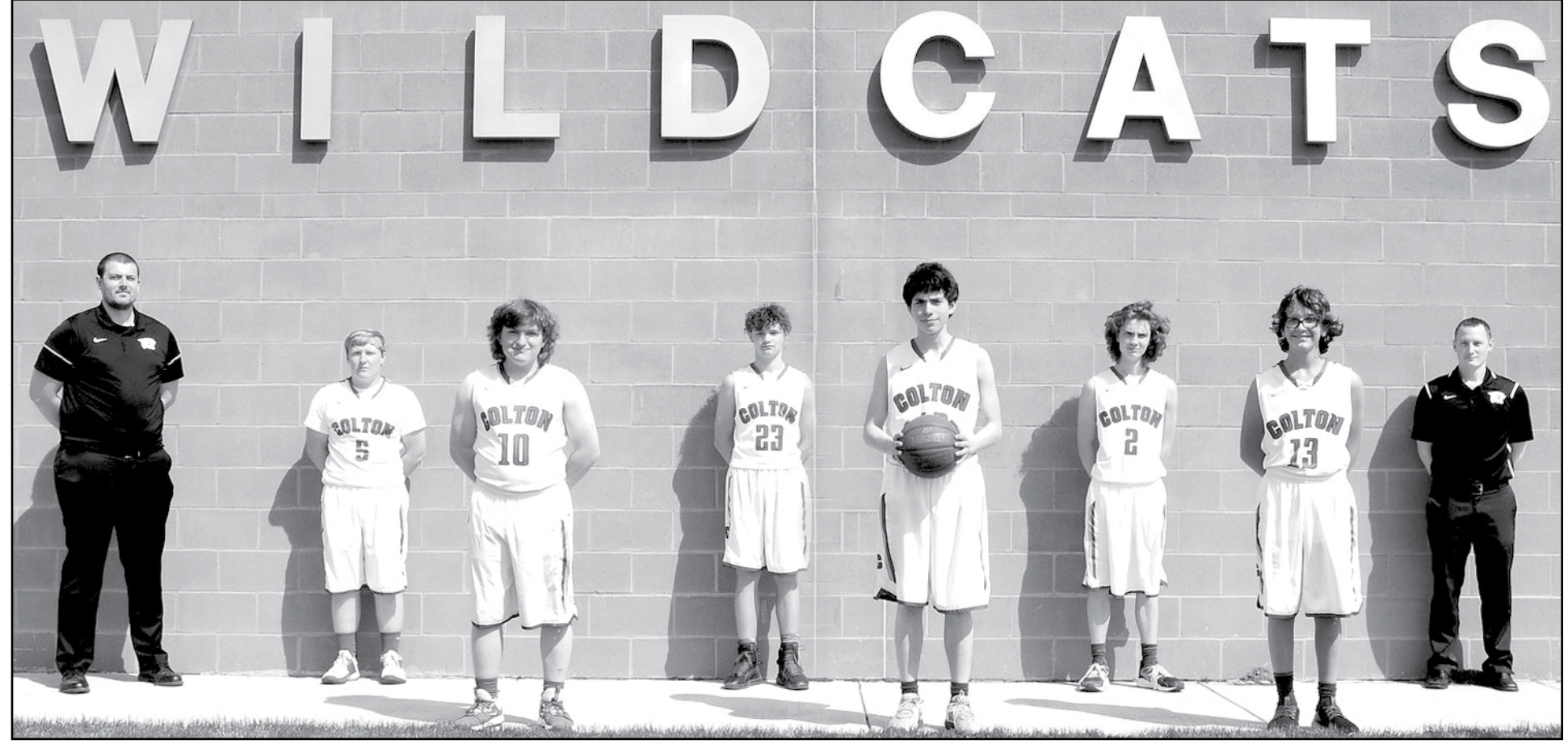
COLTON SCHOOL DISTRICT